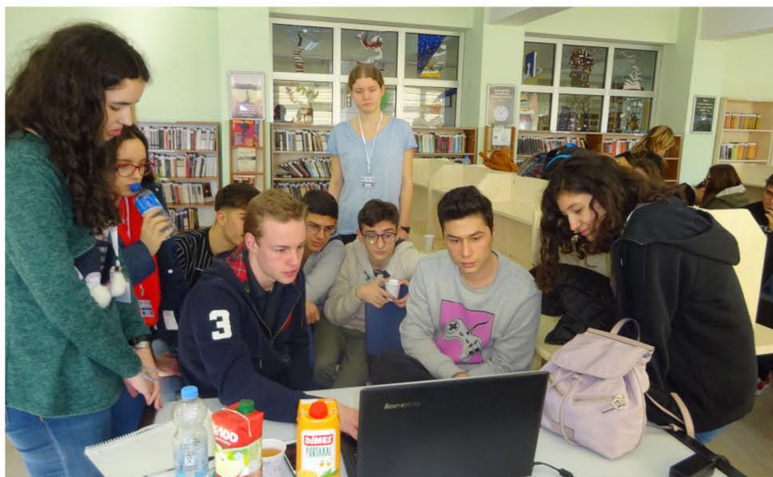
international students working in the school's library

The first host country in the project was Turkey with the high school “Menderes Anadolu Lisesi” in Nazilli. The focus was on agricultural problems from an economic and sustainable point of view. Our goal for this visit was to get to know the Turkish education system, possible job opportunities in the agricultural sector and to create international connections between the students.