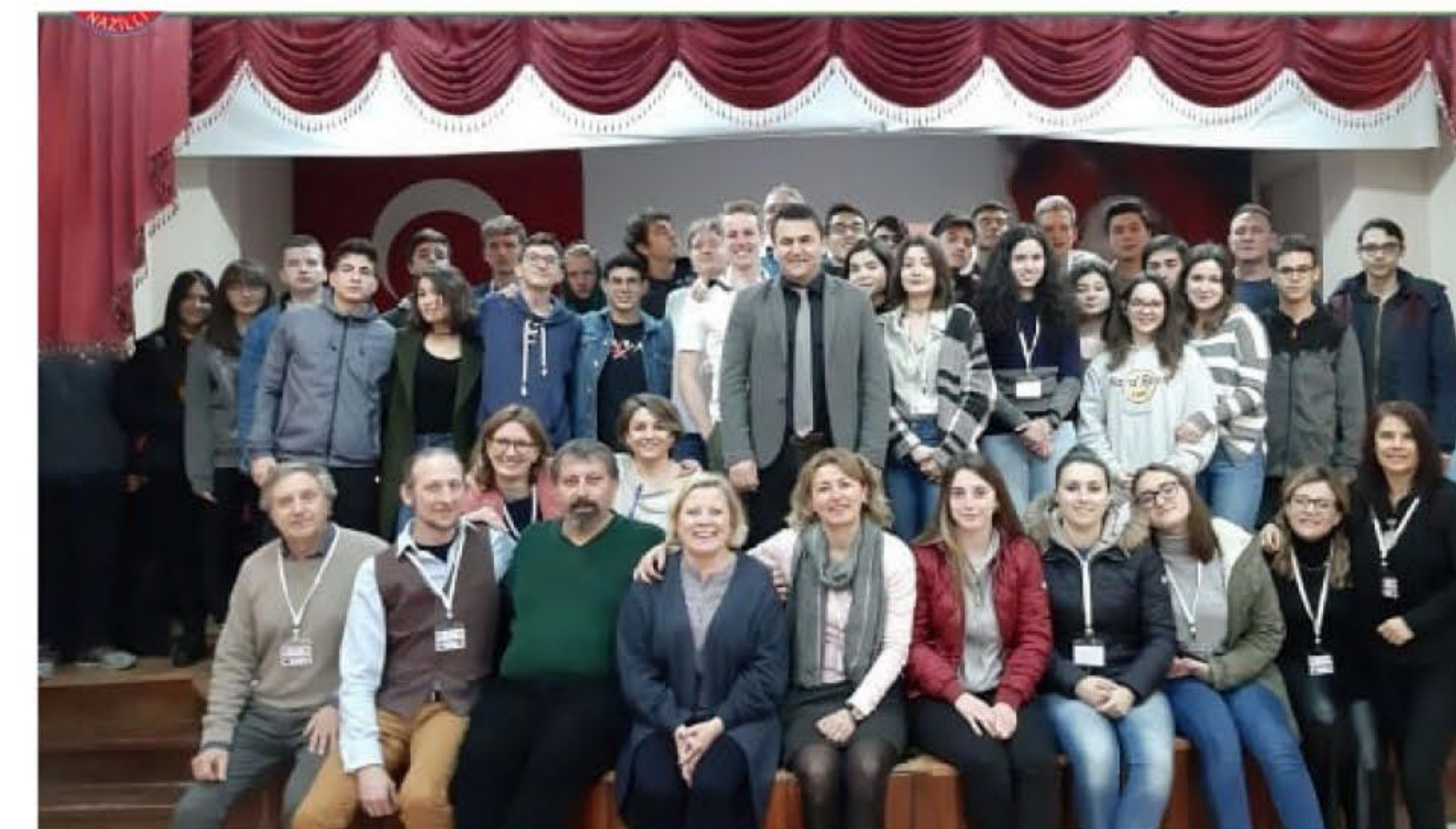
the delegations at the closing ceremony

Meeting in Nazilli, Turkey 10.02.-17.02.2019