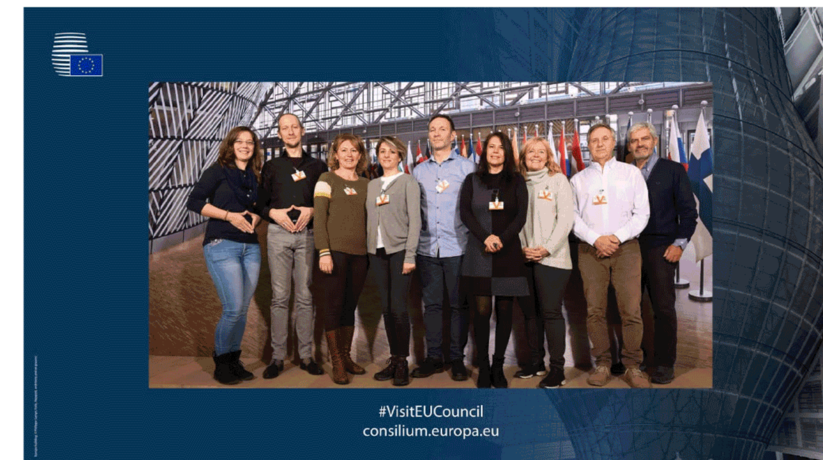
the delegations in the European Council's Visitor's Center

Coordinators Meeting in Brussels 29.11.-05.12.2018