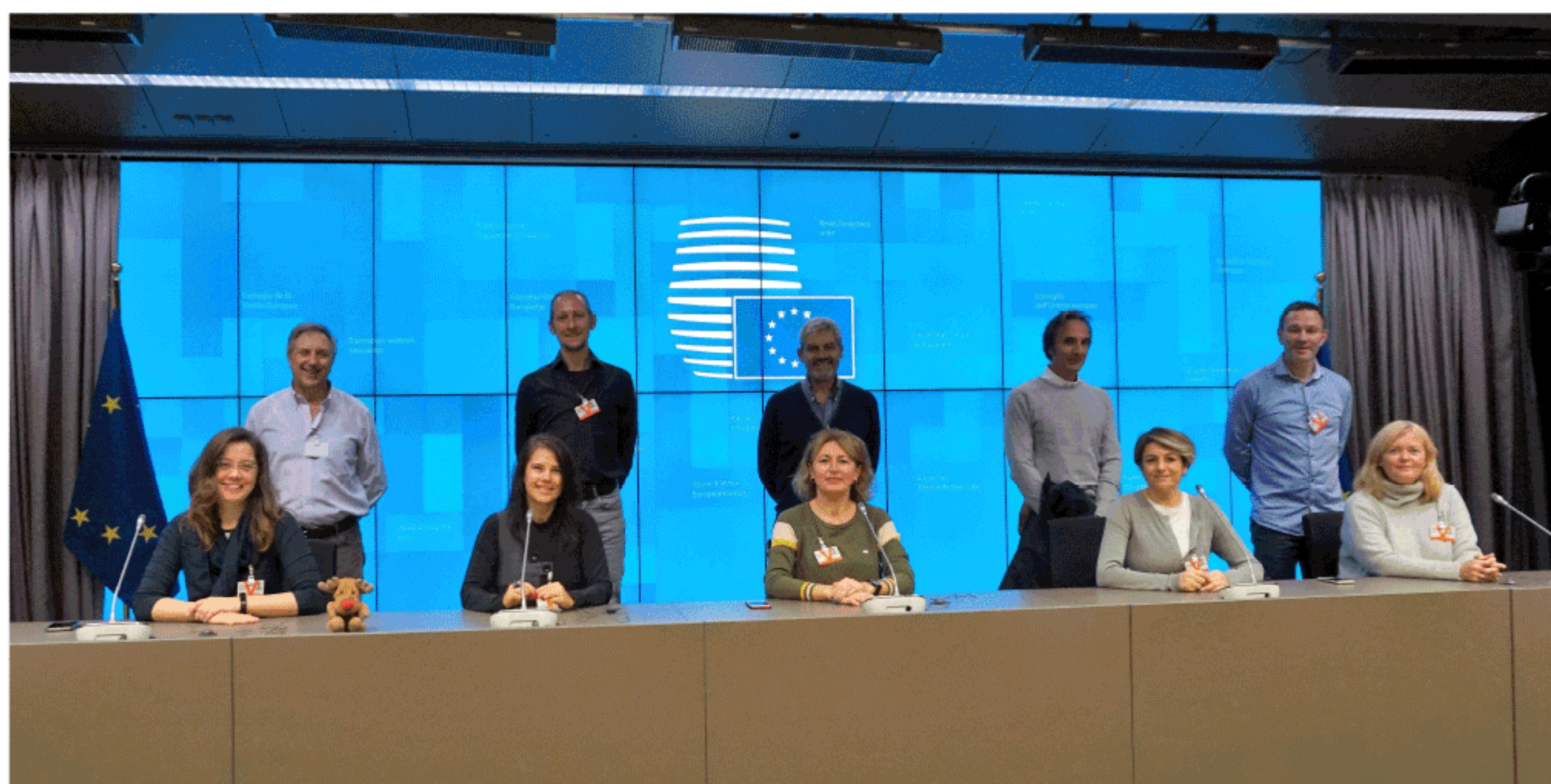
the coordinators group in the council of the EU

In the very beginning of our project, we did not meet in one of our partners' schools but in Brussels. It's an unusual start of such a project, nevertheless, it seemed to be useful.