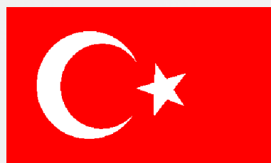
Menderes Anadolu Lisesi Nazilli