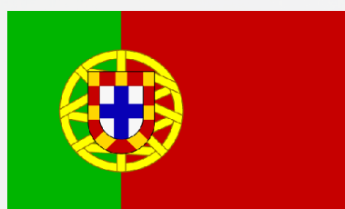
Agrupamento de Escolas de Constância