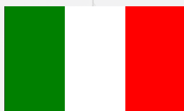
I.I.S. Fermi Filangieri Formia