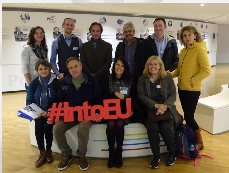
the coordinators group in the EC Visitor's Center