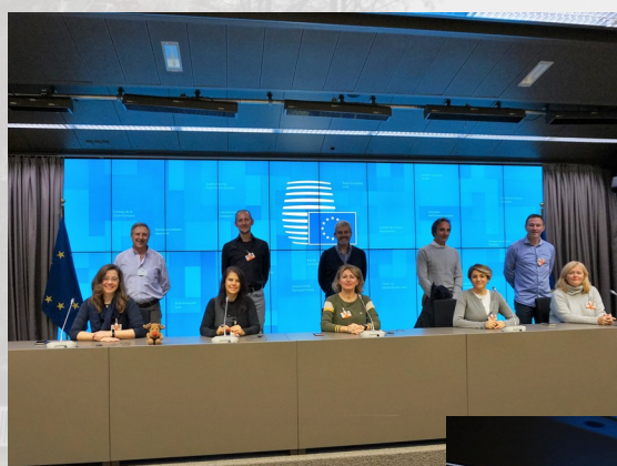
Visiting the Council of the EU and the European Council.