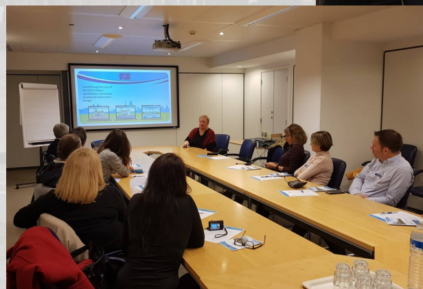
Visiting the European Commission and the European Economic and Social Committee